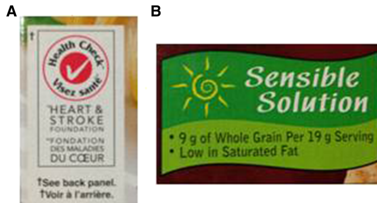
Figure 1 Front-of-pack symbols evaluated in the present study. (A) Heart and Stroke Foundation Health Check™ and (B) Kraft Sensible Solutions™.

comparisons, worrying that nutritious foods not part of a FOP program may, by default, be perceived as less healthy [12,13]. This is of concern, as many foods may not carry FOP symbols for reasons unrelated to their nutritional value. However, just how many foods are being excluded from carrying a specific FOP symbol for reasons unrelated to nutritional composition has not been examined.